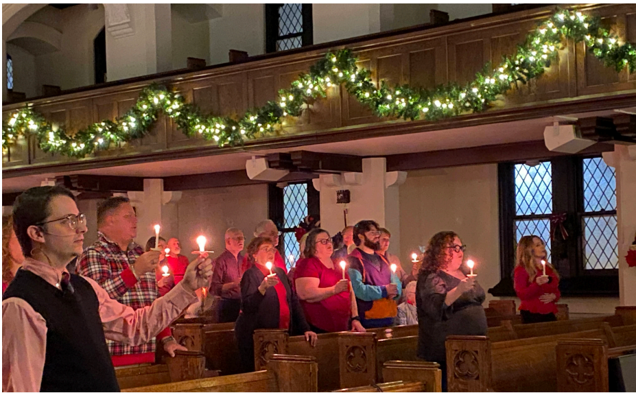
The sanctuary was decorated for the Christmas season. Worshipers lit candles and sang together during Christmas Eve service and also took part in communion.